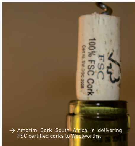
→ Amorim Cork South Africa is delivering FSC certified corks to Woolworths.

"Factors such as cork's low carbon footprint and certified sustainability are very much part of our Good Business Journey. Using FSC corks underscores our commitment to responsible business practices, which we want our customers to be part of, as well as helping to change the way people buy and use materials in general."