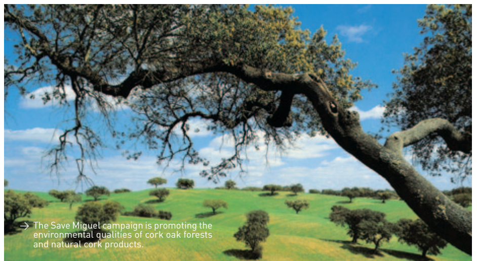
→ The Save Miguel campaign is promoting the environmental qualities of cork oak forests and natural cork products.

For more information on the Save Miguel campaign visit www.savemiguel.com