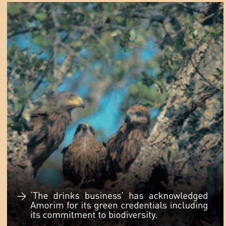
→ 'The drinks business' has acknowledged Amorim for its green credentials including its commitment to biodiversity.

For further information on Amorim's green credentials visit www.corkfacts.com